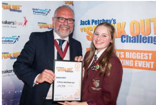
East Essex Regional Final 2021-22

What an exciting few months we have had over in the English department! In the last newsletter we told you all about the fantastic opportunity some of our Year 10 students had when they were invited to participate in a public speaking workshop. Since then, a lot has happened!