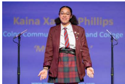
East Essex Regional Final 2022-23